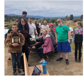
Cascade Pollinator Project Bee hotels and flower plugs