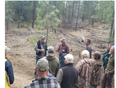
Annual Spring Forestry Tour