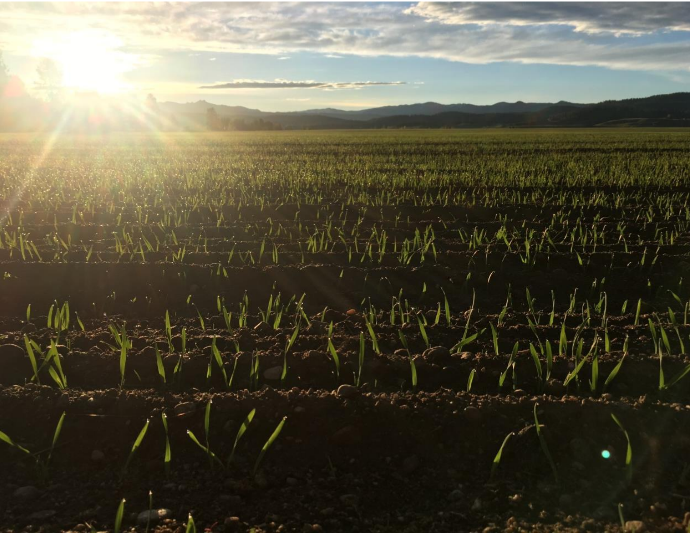
2019 Oats south of Gold Fork River