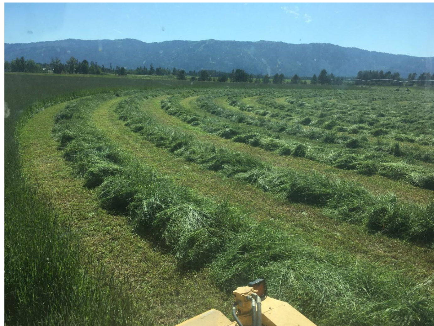
2020 Export Timothy Hay North of Gold Fork River